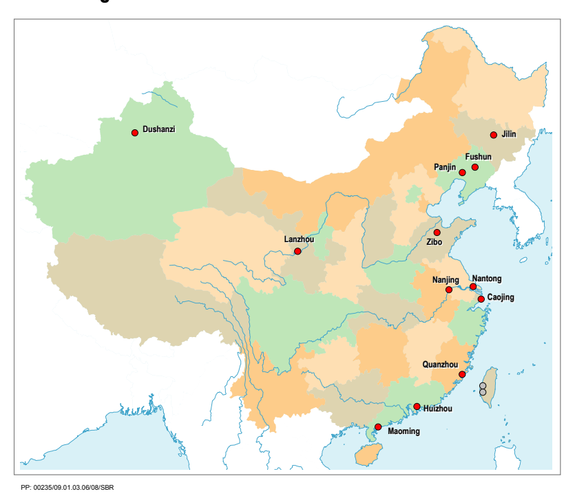
Figure D.2 Location of SBR Plants in China