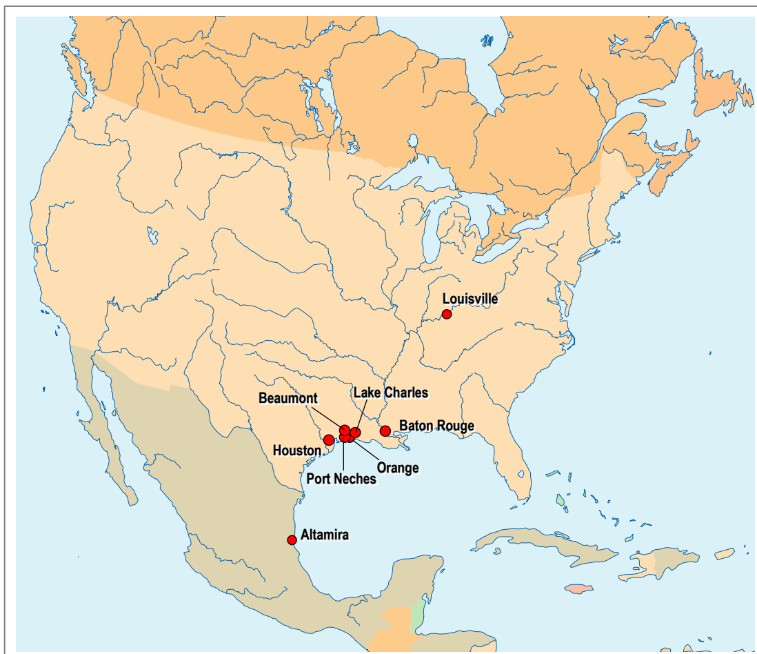
Figure D.2 Location of SBR Plants in North America